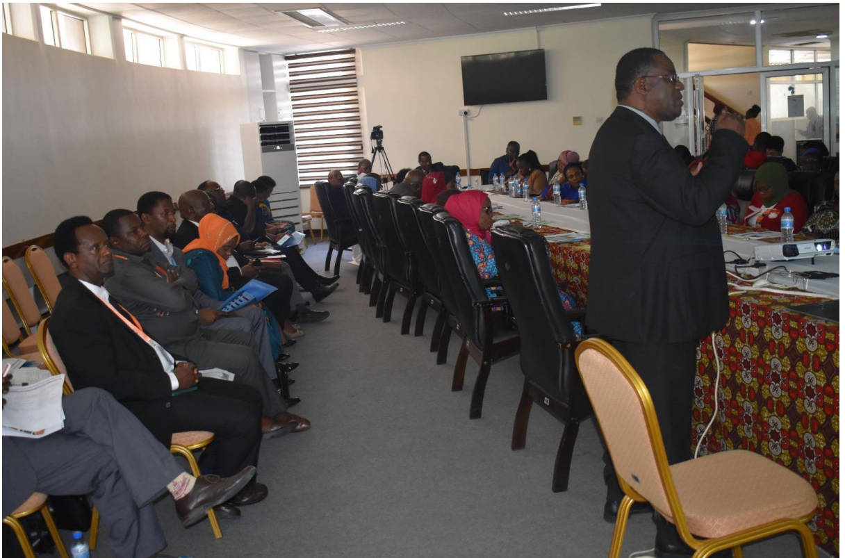
TaTEDO-SESO staff proposing recommendations to parliamentarians.

We thank the British Government through the MECs program for starting and developing these efforts on a large scale. We also thank the Government of Tanzania, and the European Community through UNCDF for supporting the ongoing efforts.