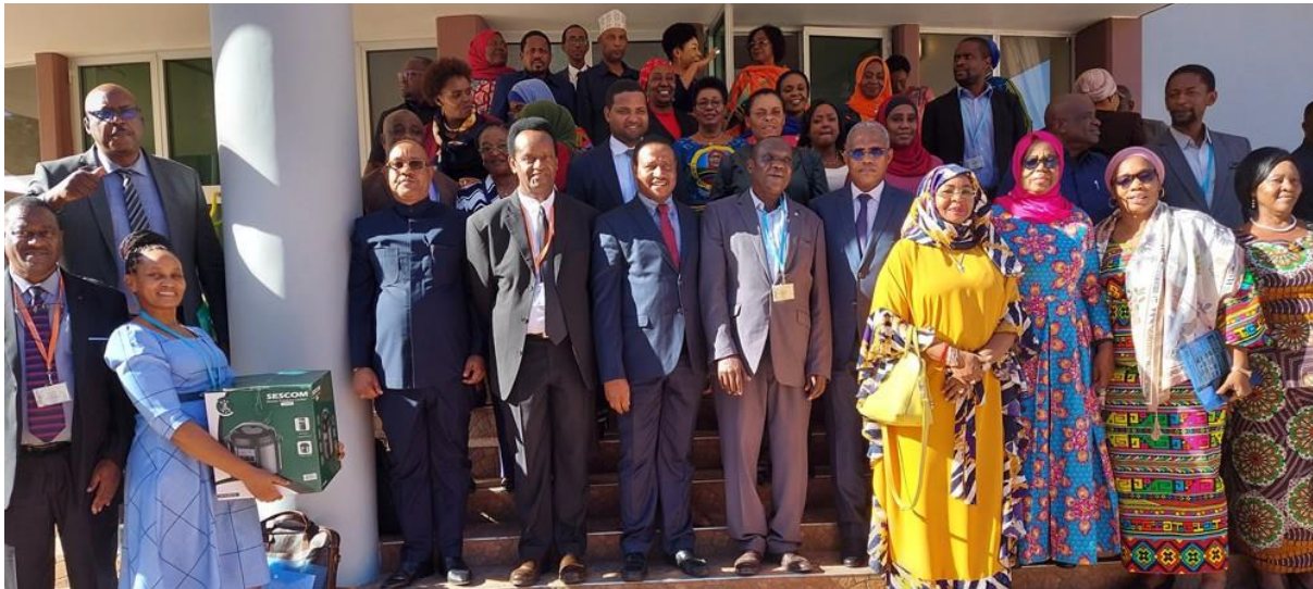
Members of Parliamentary Committees, TAPAFE, and TaTEDO-SESO allies attended the Advocacy Workshop in the Parliament

finance, respectively. Parliamentary committees provide greater freedom for in-depth analysis and debate, making it possible for Members of Parliament and ultimately the Parliament itself to perform the core functions of law-making, oversight, and representation. Any reforms undertaken in the sectors are supposed to be discussed by the committee, which prepares its paper on those issues for tabling and discussion with other members of parliament during the main sessions of the national assembly.