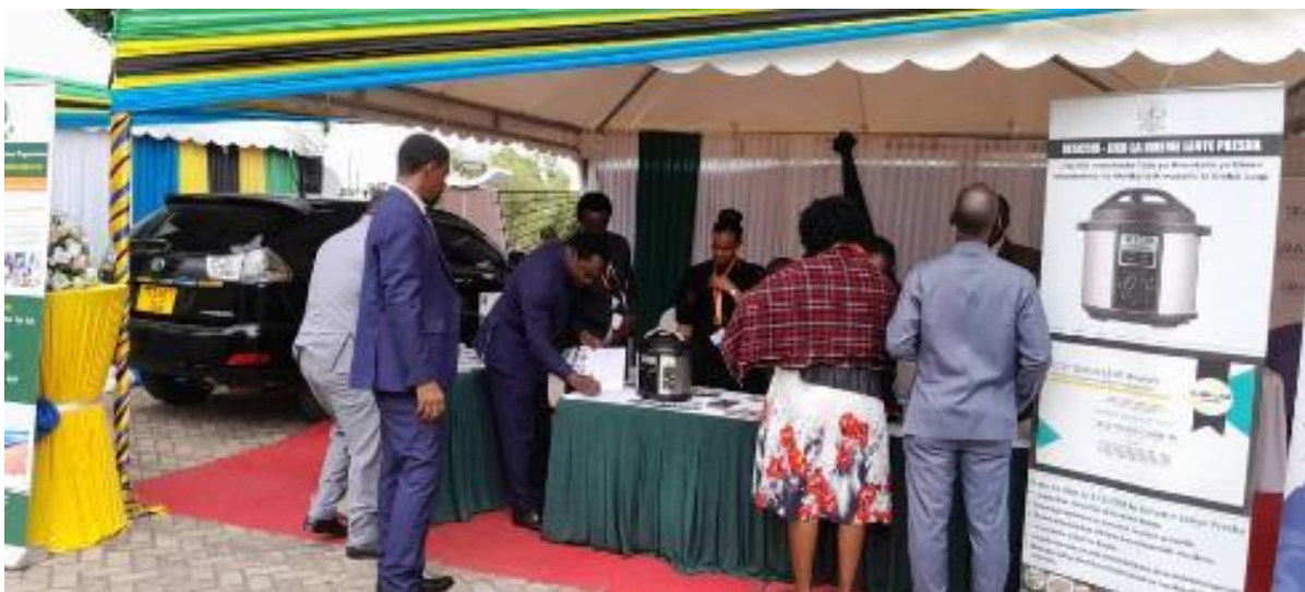
TaTEDO-SESO Pavilion in the Parliament Compounds

SESCOM through its Pavilion at the Bunge (Parliament) Compounds displayed and exhibited Electric Clean Cooking Appliances (Electric Pressure Cookers). The SESCOM pavilion had promotion and awareness materials (brochures, calendars, banners, etc), clean cooking publications, and highly efficient cooking appliances (EPCs) for promoting and selling to the MPs and other potential users.