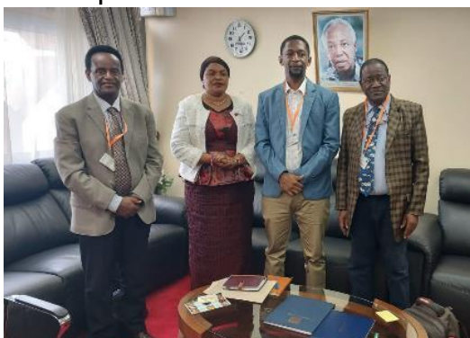
TaTEDO-SESO Team with Hon Muhagama

The representatives from TaTEDO, TSP, SESCO, and other partners also held a meeting with the Minister of State, Prime Minister's Office (Policy, Parliamentary Affairs, Labour, Youth, Employment and People with Disability), Hon. Jenista Muhagama to discuss current efforts of clean cooking by private sectors and CSOs with support from DPs.