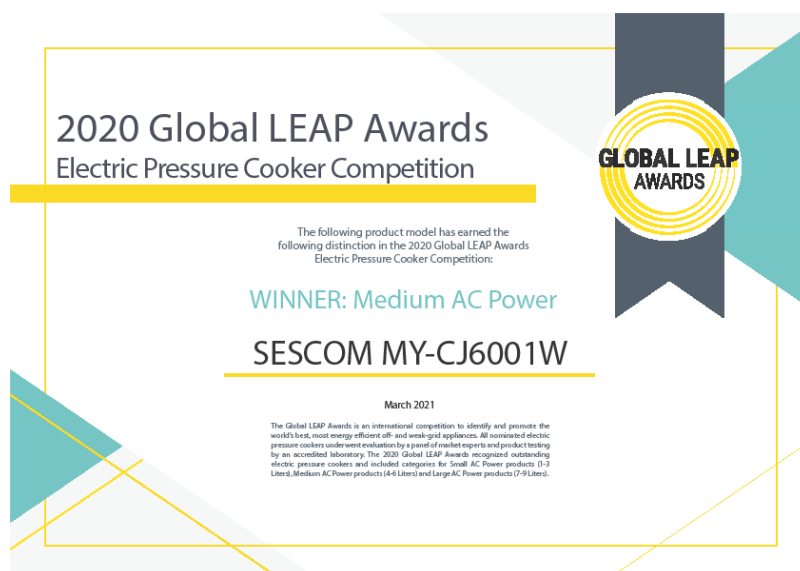
Global Leap Competition Certificate

The first winner of the international competition "Global Leap Award Competition 2020" and received a certificate of the first winner for the quality of medium-sized EPC appliances (4-7 liters).