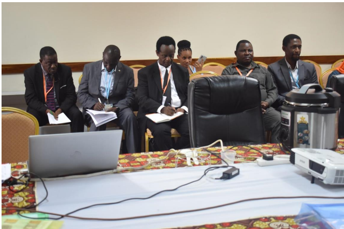
TaTEDO-SESO, CCAT, and SEF Team during Discussion with MPs