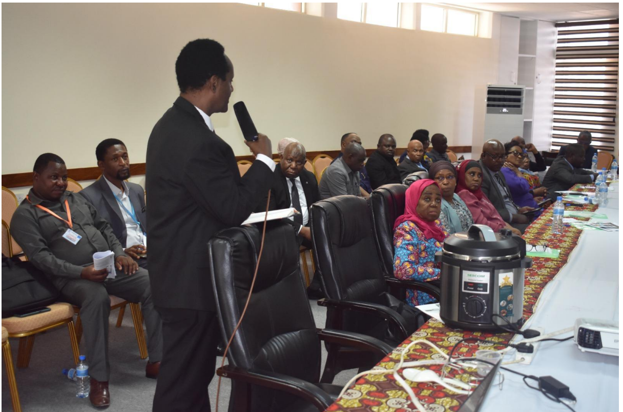
Paper Presentation to the Parliamentary Committees (Energy and Minerals / Finance and Planning)

Several previous efforts to move people in the communities from biomass to other clean energy have been made. Still, 85 percent of Tanzanians are using firewood and charcoal as fuels for cooking. The most people (about 90%) are using traditional stoves with a thermal efficiency of 10%. According to the Energy Access Situation Report (REA and NBS 2020) about 63.5 percent of households in the country depend on firewood as fuel for cooking while 26.2 percents of households depends on charcoal using traditional metal stoves with a thermal efficiency of 15 percent. Only 10 percent of people in Tanzania are using other fuels such as LPG (5.1%), and 3 percent are using electricity for cooking.