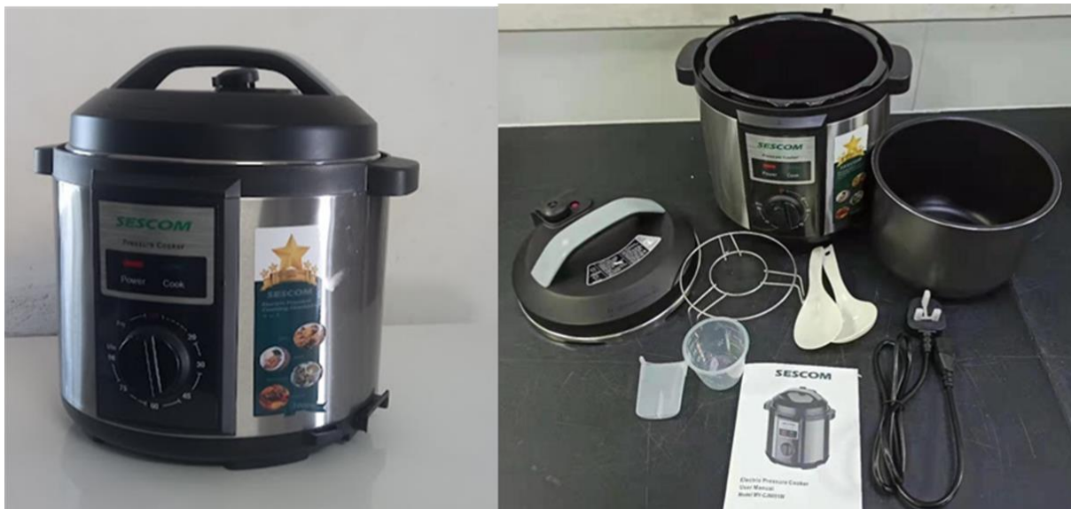
SESCOM Electric Pressure Cooker