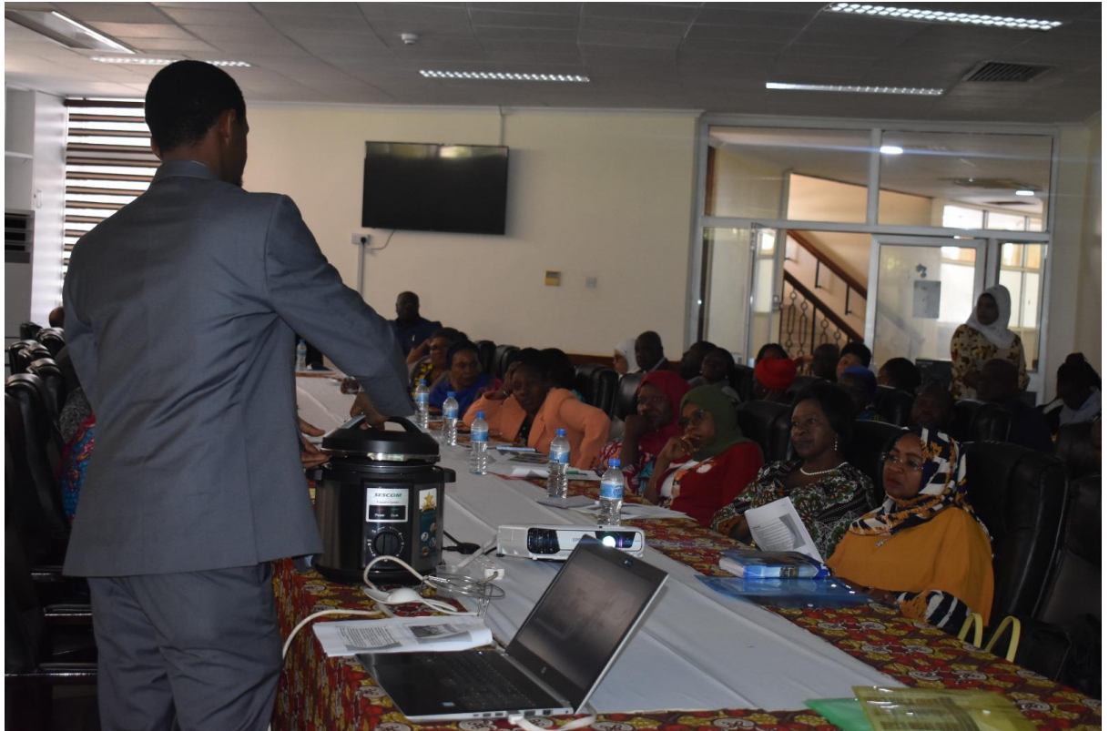
TaTEDO-Staff Discussing Efforts Used by TaTEDO-SESO in Electric Cooking