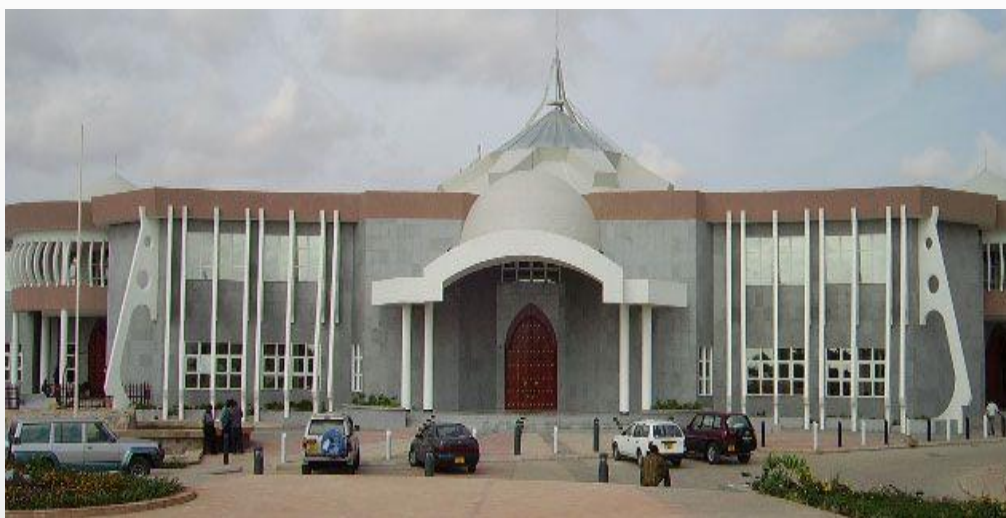
Parliament Building, Dodoma, Tanzania