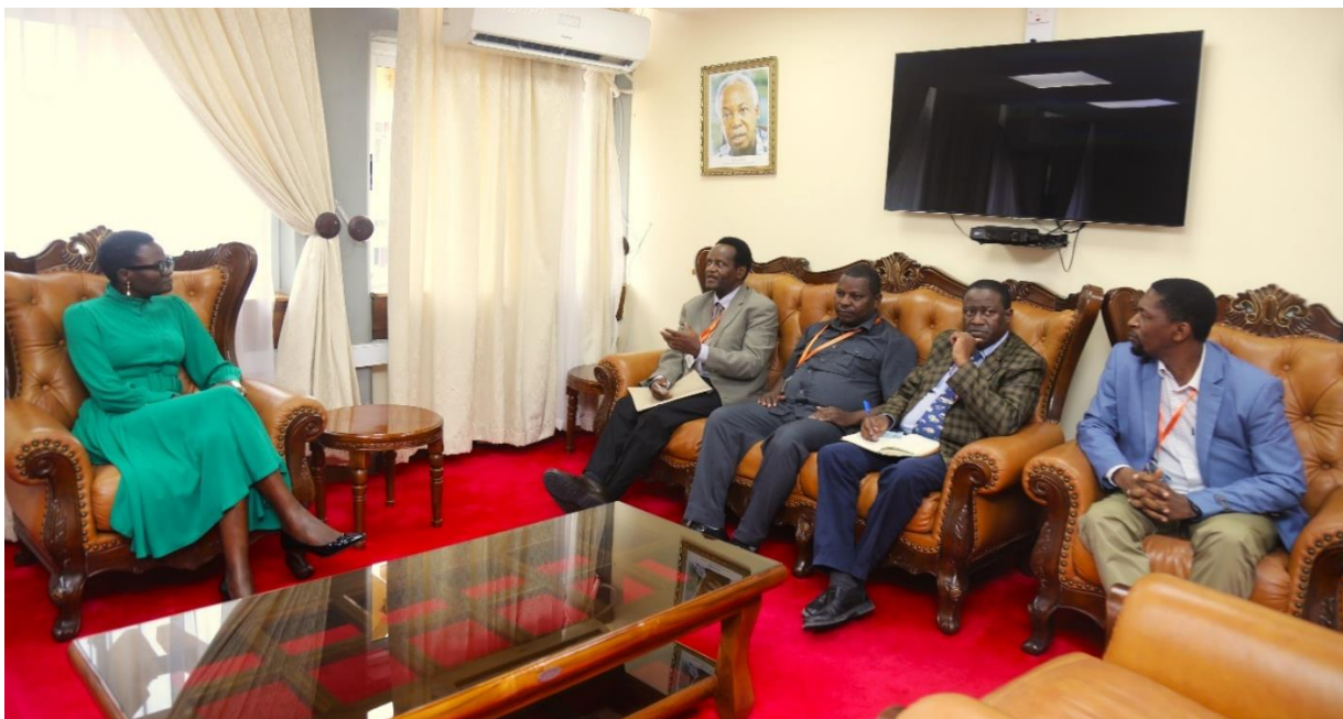
The TaTEDO-SESO and CCAT team during the Clean Cooking discussion with the Speaker of the Parliament.

The team on 18th April 2023, had the opportunity of meeting the Speaker of the Parliament of the United Republic of Tanzania, Hon. Dr. Tulia Akson. The team exchanged ideas with the Speaker on clean cooking efforts in Tanzania and the part that could be played by the Government and MPs to disseminate clean cooking solutions to the community. The Speaker was awarded an Electric Pressure Cooker (EPC) for practicing clean electric cooking and being a champion and promoter of this appliance to other PMs.